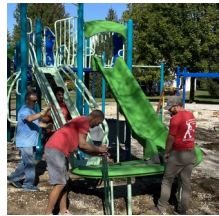
Improve Our Parks