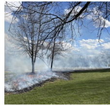
Improve Our World