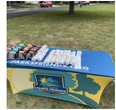
Be a Park Friend